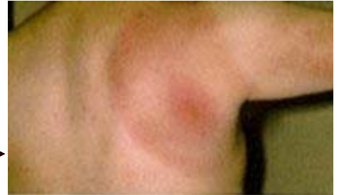
Bull's-eye Rash

Lyme Disease can cause long- term health problems. It is passed through tick bites. It cannot be spread from person to person.